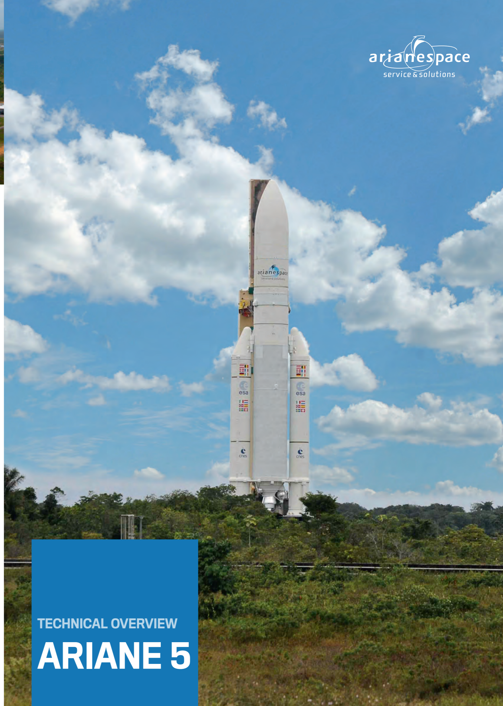
Ariane 5 - September 2015

For many years, all CSG actors have been committed to protecting the environment, through strict measures during spacecraft preparation, launch, and flight. The impact of the launch vehicle in flight on the environment and the careful disposal of hazardous waste are carefully monitored.