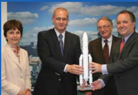
The Alphasat I-XL contract was signed at Inmarsat's headquarters in London