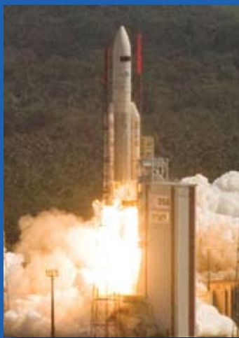
The heavy-lift Ariane 5 operated from the Spaceport's ELA-3 launch zone